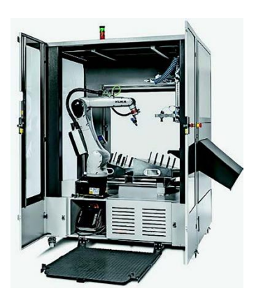
Inside an open Mobile Bending Cell.

shifts, the switches can achieve over 1.8 million switching cycles per year."