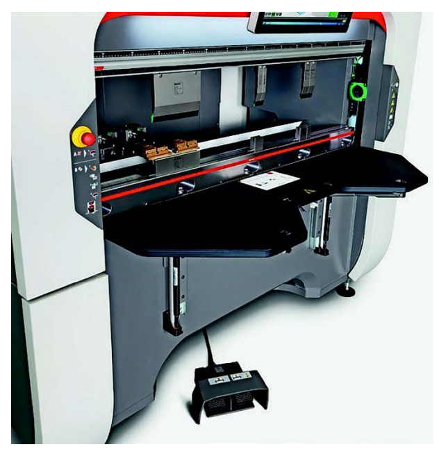
Flexible and precise: the Xpert 40 is known as the 'Swiss army knife' of press brakes.

bending processes in "unmanned" shifts. And without the robot module, the Xpert is also the ideal machine for highly efficient and precise operatorcontrolled bending. The automation unit communicates with the press brake via remote technology from the steute Wireless range.