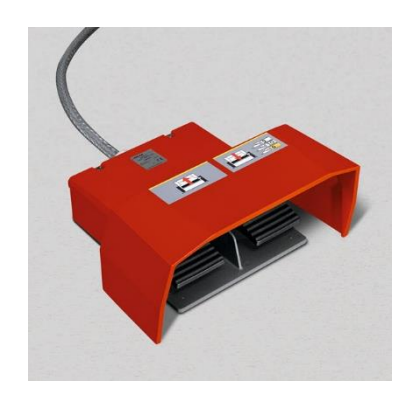
The foot control – cabled or wireless.