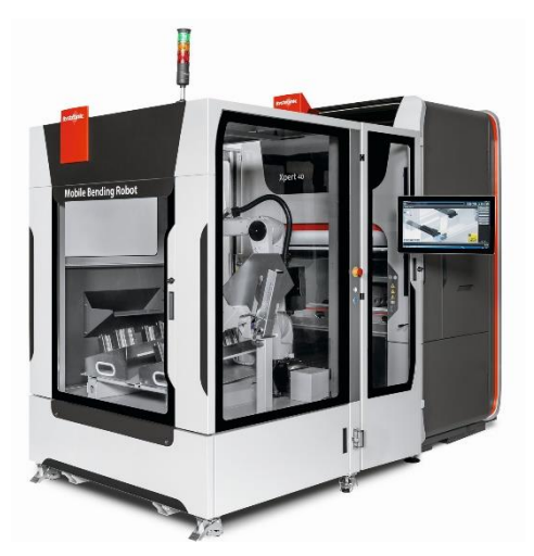
Docked on: the Mobile Bending Cell means that even a conventional press brake can be automated.