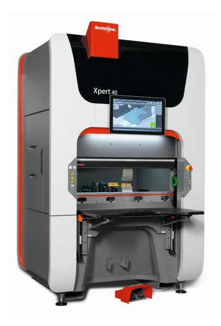
The Xpert series from Bystronic stands for allround bending and folding with high precision.